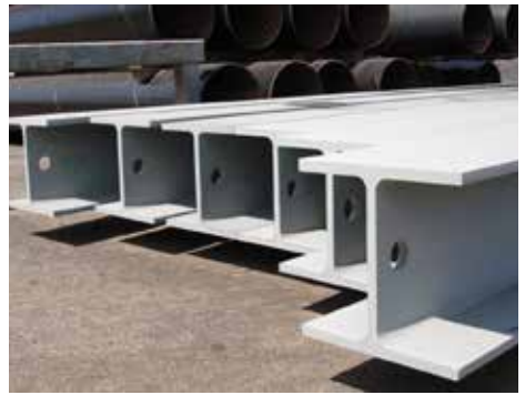
HP16 x 162 with coating and handling holes.